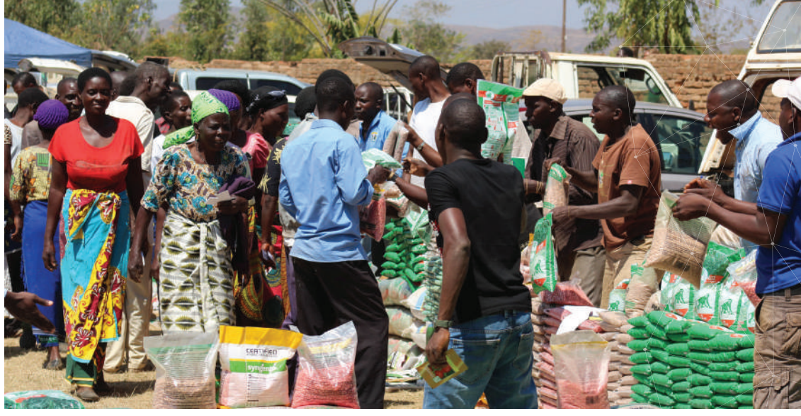
Smallholder farmers buying seed during a seed fair in Lilongwe