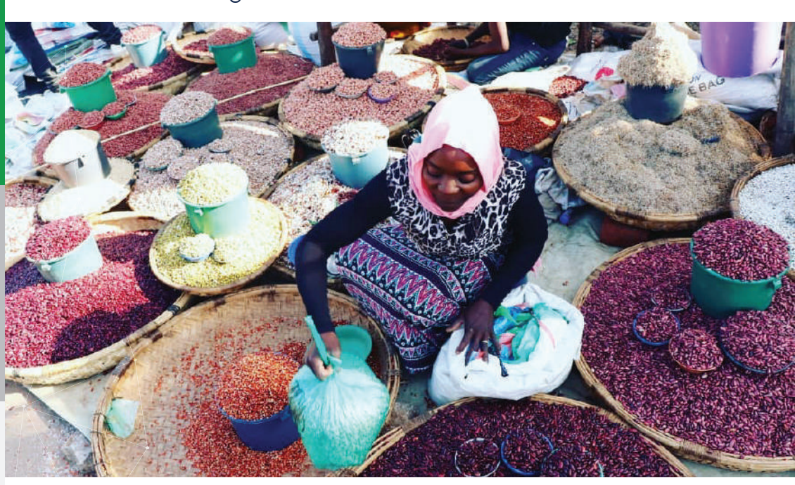
A woman farm producer seller at Liwonde Market

This will have two strategic goals; Creating a vibrant agricultural market that promotes value addition for agricultural produce in Malawi and promoting improvements in the quality and grading standards for all agricultural commodities.